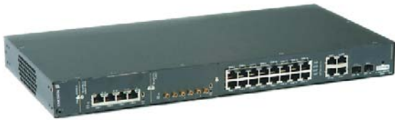
Marconi OMS 860